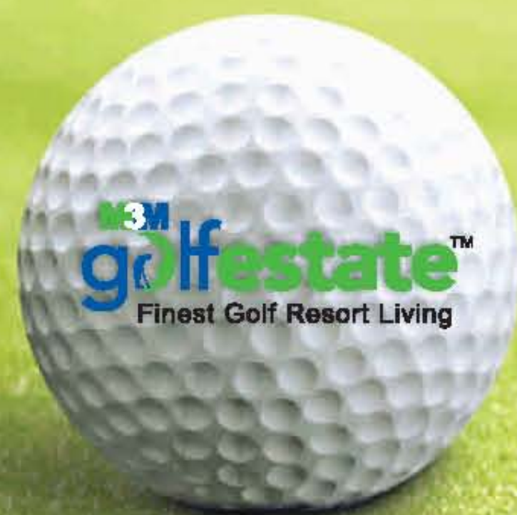
CLASSIC GOLF COURSE